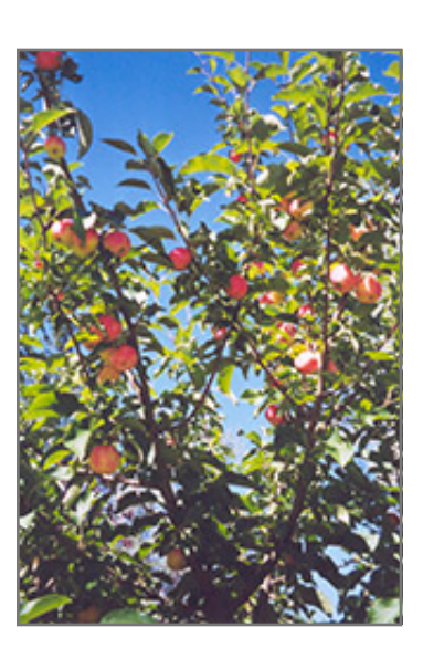
September Ruby Apple fruit

Aside from its primary use as an edible, September Ruby Apple is sutiable for the following landscape applications;