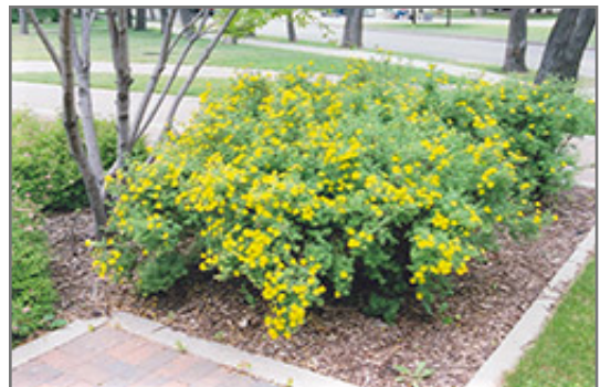
Coronation Triumph Potentilla in bloom