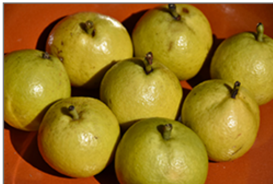
Golden Spice Pear fruit

This is a dense deciduous tree with a shapely oval form. Its average texture blends into the landscape, but can be balanced by one or two finer or coarser trees or shrubs for an effective composition. This is a high maintenance plant that will require regular care and upkeep, and is best pruned in late winter once the threat of extreme cold has passed. Gardeners should be aware of the following characteristic(s) that may warrant special consideration;