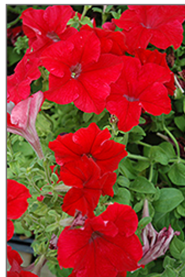
Dreams Red Petunia flowers