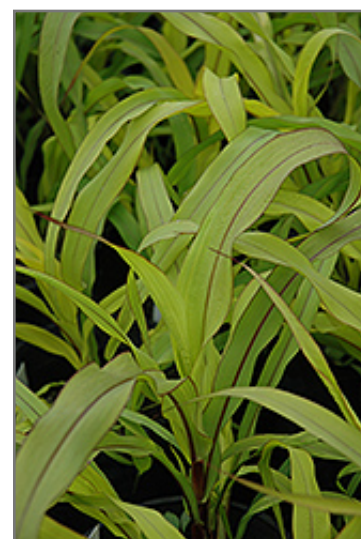
Jester Millet foliage