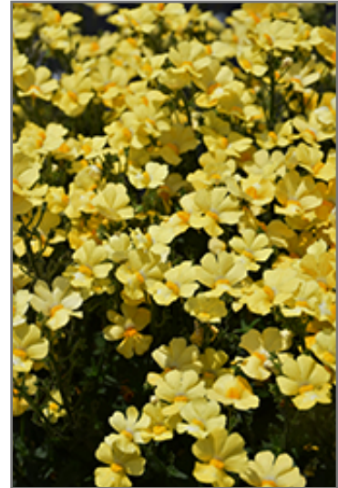
Sunsatia Lemon Nemesia flowers

Sunsatia Lemon Nemesia will grow to be about 10 inches tall at maturity, with a spread of 18 inches. When grown in masses or used as a bedding plant, individual plants should be spaced approximately 12 inches apart. Its foliage tends to remain low and dense right to the ground. This fast-growing annual will normally live for one full growing season, needing replacement the following year.