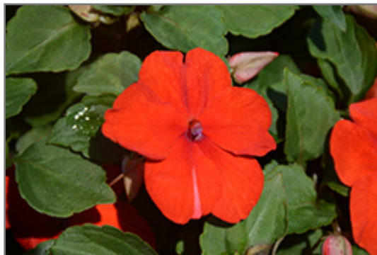
Super Elfin XP Scarlet Impatiens flowers