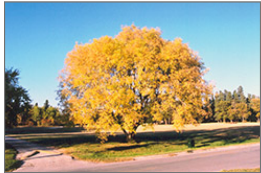
Boxelder in fall