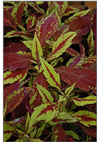
Pineapple Coleus foliage