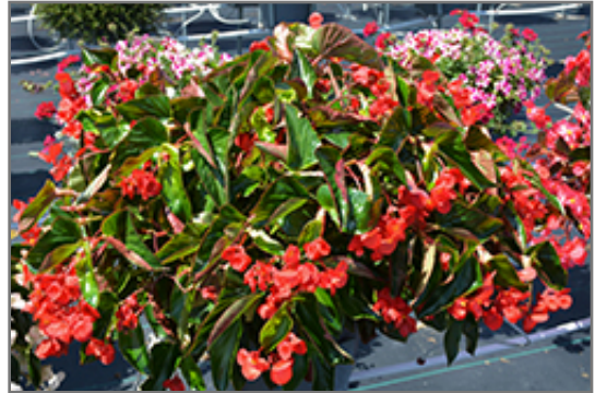
Dragon Wing Red Begonia in bloom

Dragon Wing Red Begonia is a fine choice for the garden, but it is also a good selection for planting in outdoor containers and hanging baskets. Because of its trailing habit of growth, it is ideally suited for use as a 'spiller' in the 'spiller-thriller-filler' container combination; plant it near the edges where it can spill gracefully over the pot. Note that when growing plants in outdoor containers and baskets, they may require more frequent waterings than they would in the yard or garden.