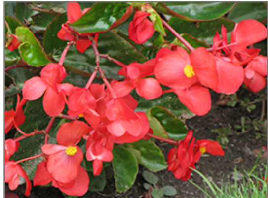
Dragon Wing Red Begonia flowers