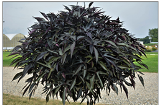
Illusion Midnight Lace Sweet Potato Vine