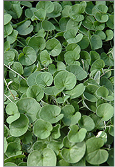
Emerald Falls Dichondra foliage