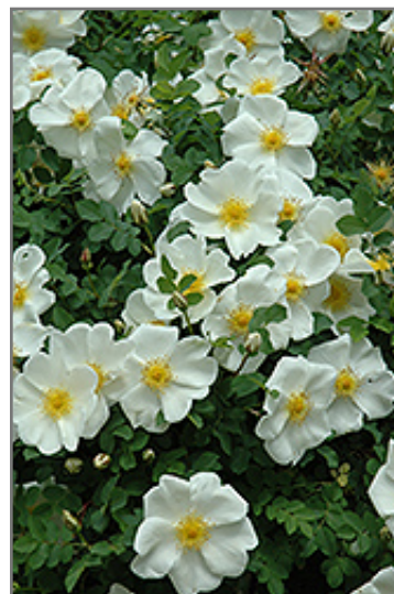
Marie Bugnet Rose flowers

Marie Bugnet Rose will grow to be about 4 feet tall at maturity, with a spread of 4 feet. It tends to fill out right to the ground and therefore doesn't necessarily require facer plants in front. It grows at a fast rate, and under ideal conditions can be expected to live for approximately 20 years.