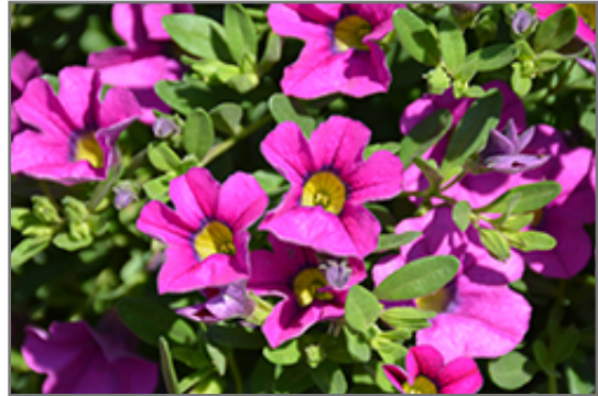
Million Bells Trailing Pink Calibrachoa flowers