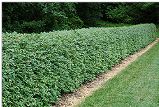
Winged Burning Bush