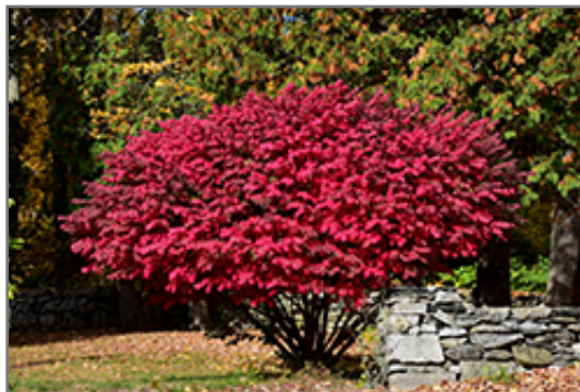
Winged Burning Bush in fall