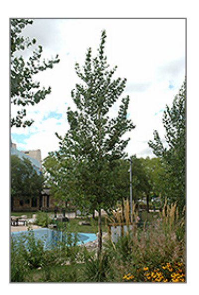
Okanese Poplar

This tree should only be grown in full sunlight. It is an amazingly adaptable plant, tolerating both dry conditions and even some standing water. It is considered to be drought-tolerant, and thus makes an ideal choice for xeriscaping or the moisture-conserving landscape. It is not particular as to soil type or pH, and is able to handle environmental salt. It is highly tolerant of urban pollution and will even thrive in inner city environments. This particular variety is an interspecific hybrid.