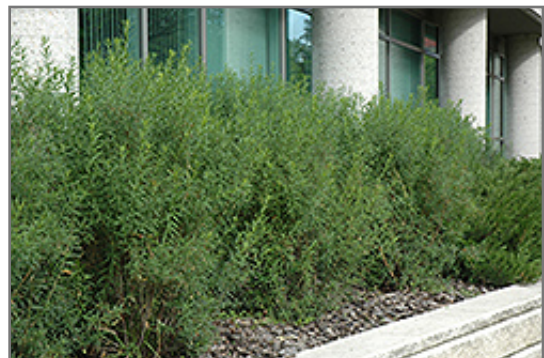
Dwarf Turkistan Burning Bush