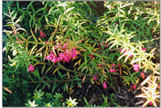
Dwarf Turkestan Burning Bush flowers

This shrub performs well in both full sun and full shade. It is very adaptable to both dry and moist locations, and should do just fine under typical garden conditions. It is not particular as to soil type or pH. It is highly tolerant of urban pollution and will even thrive in inner city environments. This is a selected variety of a species not originally from North America.