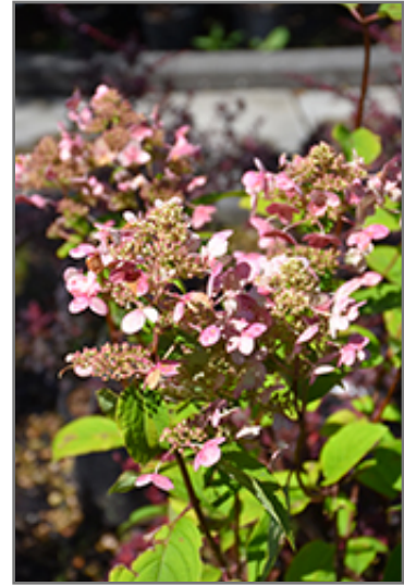
Fire And Ice Hydrangea flowers

Fire And Ice Hydrangea makes a fine choice for the outdoor landscape, but it is also well-suited for use in outdoor pots and containers. With its upright habit of growth, it is best suited for use as a 'thriller' in the 'spiller-thriller-filler' container combination; plant it near the center of the pot, surrounded by smaller plants and those that spill over the edges. It is even sizeable enough that it can be grown alone in a suitable container. Note that when grown in a container, it may not perform exactly as indicated on the tag - this is to be expected. Also note that when growing plants in outdoor containers and baskets, they may require more frequent waterings than they would in the yard or garden. Be aware that in our climate, most plants cannot be expected to survive the winter if left in containers outdoors, and this plant is no exception. Contact our experts for more information on how to protect it over the winter months.