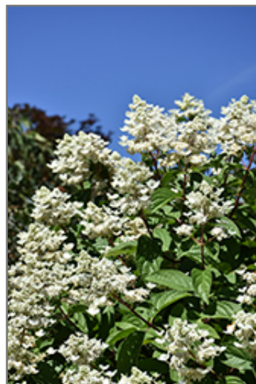
Fire And Ice Hydrangea flowers