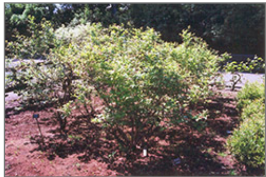
Northland Blueberry