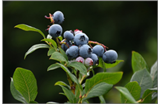
Northland Blueberry fruit

Northland Blueberry is a multi-stemmed deciduous shrub with an upright spreading habit of growth. Its average texture blends into the landscape, but can be balanced by one or two finer or coarser trees or shrubs for an effective composition.