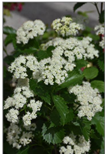
Blue Muffin Viburnum flowers