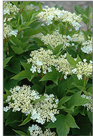
Alfredo Highbush Cranberry flowers

Alfredo Highbush Cranberry is recommended for the following landscape applications;