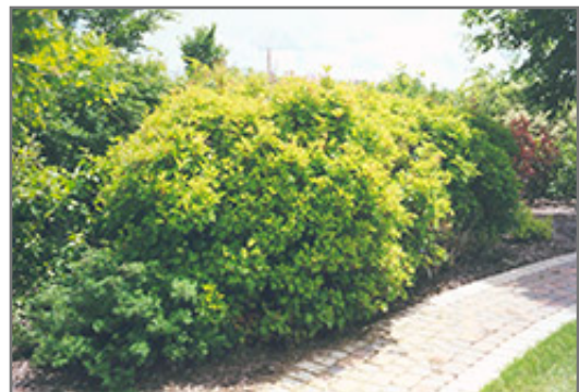
Alfredo Highbush Cranberry