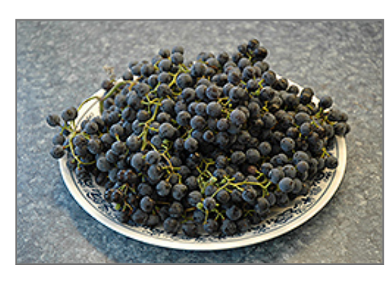
Frontenac Grape fruit

This is a dense multi-stemmed deciduous woody vine with a spreading, ground-hugging habit of growth. Its relatively coarse texture can be used to stand it apart from other landscape plants with finer foliage. This is a high maintenance plant that will require regular care and upkeep, and requires a special pruning regimen to reliably produce fruit; consult a specific reference guide or contact the store for proper pruning techniques. It is a good choice for attracting birds to your yard. Gardeners should be aware of the following characteristic(s) that may warrant special consideration;