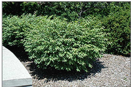
Fire Ball Burning Bush