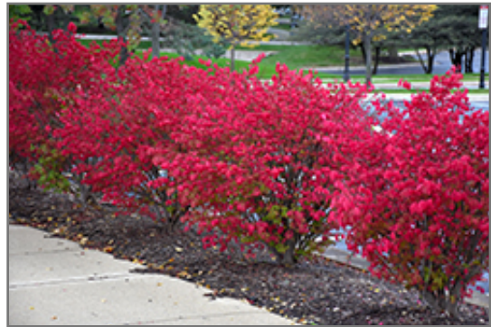
Fire Ball Burning Bush in fall