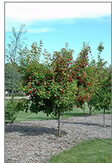
Ruby Slippers Amur Maple