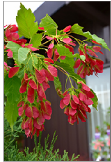
Ruby Slippers Amur Maple fruit

Ruby Slippers Amur Maple will grow to be about 20 feet tall at maturity, with a spread of 20 feet. It has a low canopy with a typical clearance of 4 feet from the ground, and is suitable for planting under power lines. It grows at a medium rate, and under ideal conditions can be expected to live for 60 years or more.