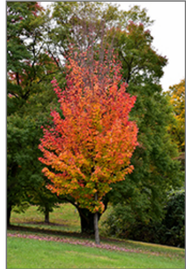
Red Rocket Red Maple in fall