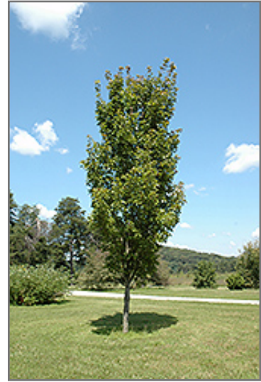
Red Rocket Red Maple

This tree should only be grown in full sunlight. It is quite adaptable, preferring to grow in average to wet conditions, and will even tolerate some standing water. It is not particular as to soil type, but has a definite preference for acidic soils, and is subject to chlorosis (yellowing) of the foliage in alkaline soils. It is somewhat tolerant of urban pollution. This is a selection of a native North American species.