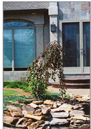
Royal Beauty Flowering Crab