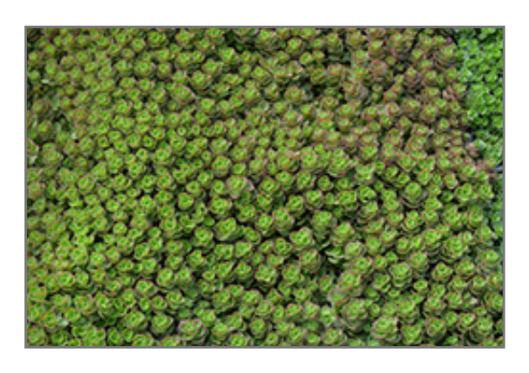
Dragon's Blood Stonecrop foliage