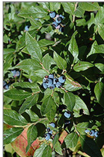
Lowbush Blueberry fruit

Aside from its primary use as an edible, Lowbush Blueberry is suitable for the following landscape applications;