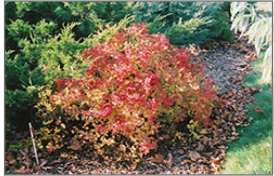
Golden Princess Spirea in fall

Golden Princess Spirea will grow to be about 3 feet tall at maturity, with a spread of 4 feet. It tends to fill out right to the ground and therefore doesn't necessarily require facer plants in front. It grows at a fast rate, and under ideal conditions can be expected to live for approximately 20 years.