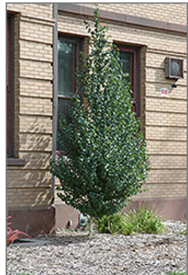
Dakota Pinnacle Japanese White Birch