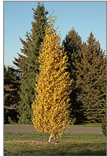
Dakota Pinnacle Japanese White Birch in fall

Dakota Pinnacle Japanese White Birch will grow to be about 35 feet tall at maturity, with a spread of 10 feet. It has a low canopy with a typical clearance of 3 feet from the ground, and should not be planted underneath power lines. It grows at a medium rate, and under ideal conditions can be expected to live for 40 years or more.