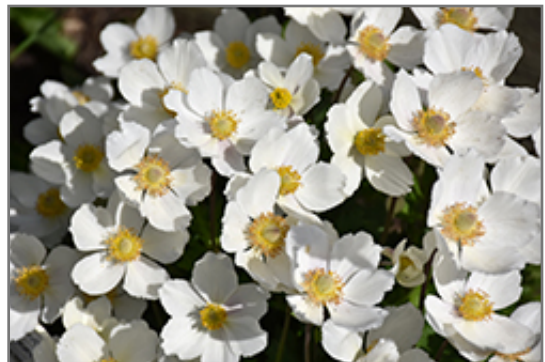
Windflower flowers