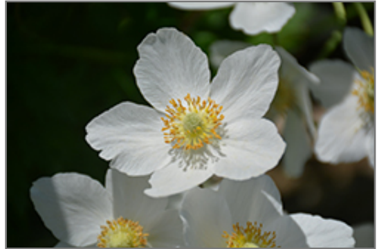
Windflower flowers