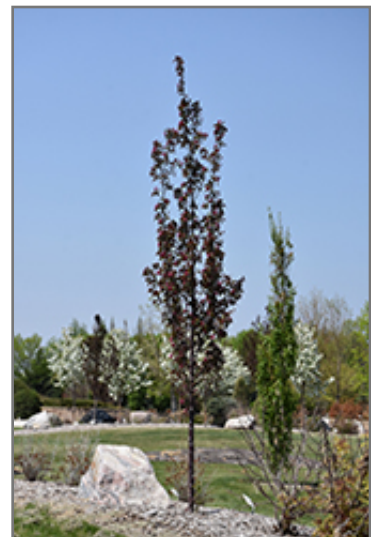
Royal Mist Flowering Crab in bloom