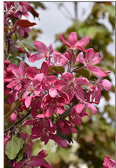
Royal Mist Flowering Crab flowers