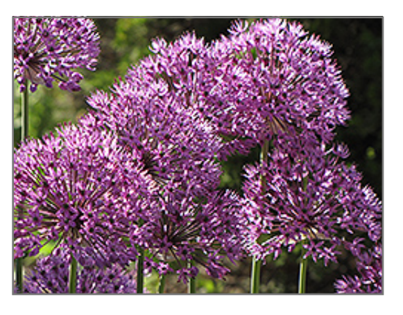
Giant Onion flowers