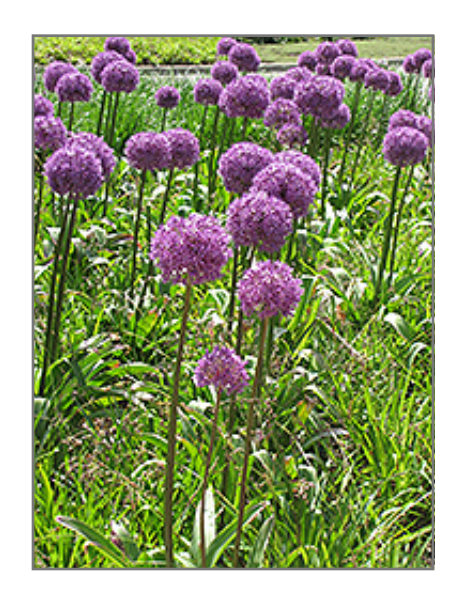
Giant Onion in bloom