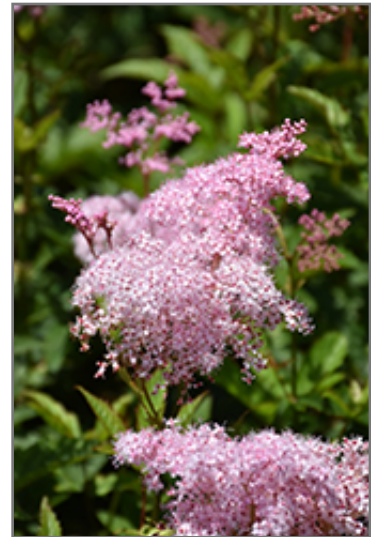
Queen Of The Prairie flowers