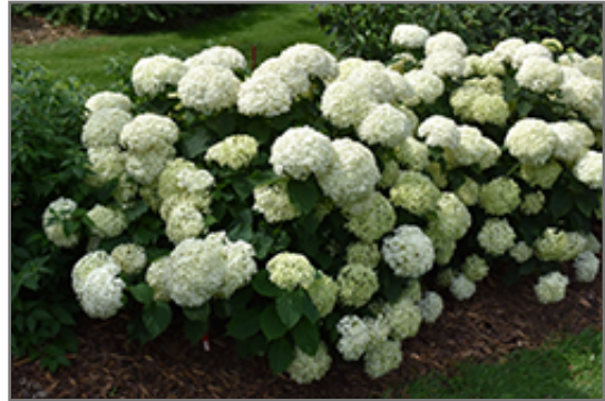
Invincibelle Limetta Hydrangea in bloom

Invincibelle Limetta Hydrangea will grow to be about 3 feet tall at maturity, with a spread of 3 feet. It tends to be a little leggy, with a typical clearance of 1 foot from the ground. It grows at a fast rate, and under ideal conditions can be expected to live for approximately 20 years.