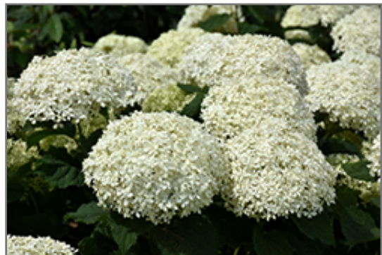
Invincibelle Limetta Hydrangea flowers