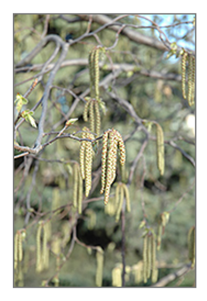
Hop Hornbeam flowers

This tree does best in full sun to partial shade. It is very adaptable to both dry and moist locations, and should do just fine under average home landscape conditions. It is not particular as to soil type or pH. It is quite intolerant of urban pollution, therefore inner city or urban streetside plantings are best avoided, and will benefit from being planted in a relatively sheltered location. Consider applying a thick mulch around the root zone in winter to protect it in exposed locations or colder microclimates. This species is native to parts of North America.