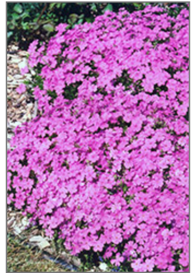
Arctic Phlox flowers