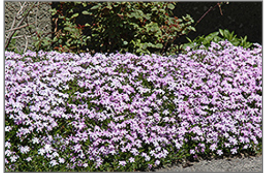
Emerald Blue Moss Phlox in bloom

This plant does best in full sun to partial shade. It prefers dry to average moisture levels with very well-drained soil, and will often die in standing water. It is considered to be drought-tolerant, and thus makes an ideal choice for a low-water garden or xeriscape application. It is not particular as to soil type, but has a definite preference for alkaline soils. It is highly tolerant of urban pollution and will even thrive in inner city environments. Consider covering it with a thick layer of mulch in winter to protect it in exposed locations or colder microclimates. This is a selection of a native North American species. It can be propagated by division; however, as a cultivated variety, be aware that it may be subject to certain restrictions or prohibitions on propagation.