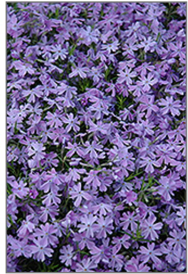
Emerald Blue Moss Phlox flowers