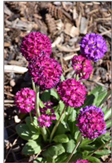
Drumstick Primrose flowers

Drumstick Primrose will grow to be only 4 inches tall at maturity extending to 12 inches tall with the flowers, with a spread of 8 inches. When grown in masses or used as a bedding plant, individual plants should be spaced approximately 6 inches apart. Its foliage tends to remain low and dense right to the ground. It grows at a fast rate, and under ideal conditions can be expected to live for approximately 5 years. As an herbaceous perennial, this plant will usually die back to the crown each winter, and will regrow from the base each spring. Be careful not to disturb the crown in late winter when it may not be readily seen!