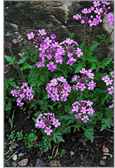
Drumstick Primrose in bloom

This plant does best in partial shade to shade. It does best in average to evenly moist conditions, but will not tolerate standing water. It is not particular as to soil type or pH. It is somewhat tolerant of urban pollution, and will benefit from being planted in a relatively sheltered location. Consider covering it with a thick layer of mulch in winter to protect it in exposed locations or colder microclimates. This species is not originally from North America.