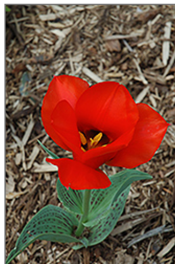
Casa Grande Tulip flowers