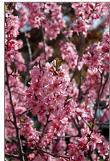
Muckle Plum (tree form) flowers