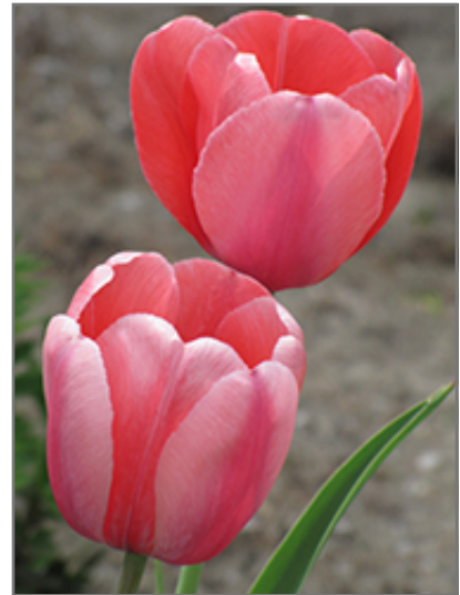
Pink Impression Tulip flowers