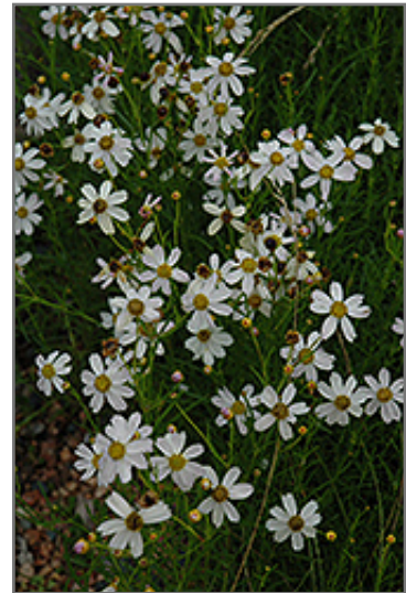
White Alpine Tickseed flowers