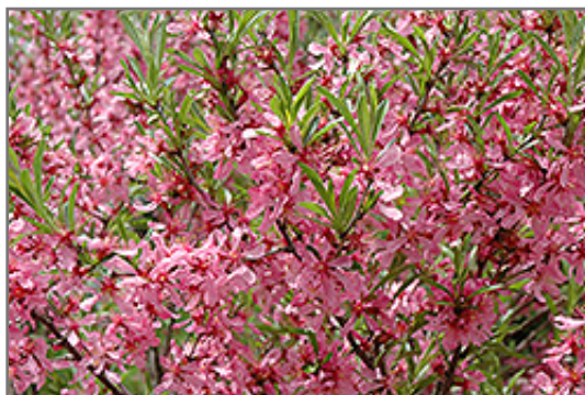
Russian Almond flowers

Russian Almond will grow to be about 5 feet tall at maturity, with a spread of 4 feet. It tends to be a little leggy, with a typical clearance of 1 foot from the ground, and is suitable for planting under power lines. It grows at a medium rate, and under ideal conditions can be expected to live for approximately 20 years.