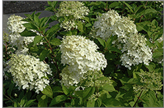
Little Lamb Hydrangea flowers

Little Lamb Hydrangea will grow to be about 6 feet tall at maturity, with a spread of 5 feet. It tends to fill out right to the ground and therefore doesn't necessarily require facer plants in front, and is suitable for planting under power lines. It grows at a medium rate, and under ideal conditions can be expected to live for 40 years or more.