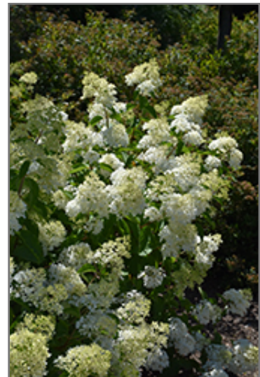
Little Lamb Hydrangea in bloom