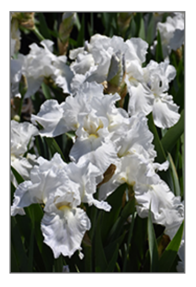
Immortality Iris flowers

Immortality Iris features bold white flag-like flowers with a buttery yellow beard at the ends of the stems in mid spring. The flowers are excellent for cutting. Its sword-like leaves remain green in colour throughout the season.