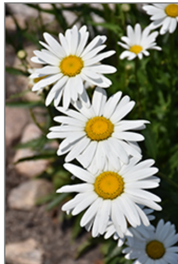
Silver Princess Shasta Daisy flowers

Silver Princess Shasta Daisy will grow to be about 12 inches tall at maturity, with a spread of 18 inches. When grown in masses or used as a bedding plant, individual plants should be spaced approximately 16 inches apart. It grows at a fast rate, and under ideal conditions can be expected to live for approximately 5 years. As an herbaceous perennial, this plant will usually die back to the crown each winter, and will regrow from the base each spring. Be careful not to disturb the crown in late winter when it may not be readily seen!