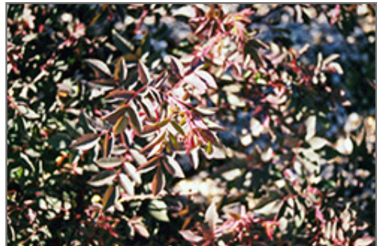
Red Leaf Rose foliage