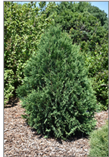
Technito Arborvitae

Technito Arborvitae will grow to be about 6 feet tall at maturity, with a spread of 30 inches. It tends to fill out right to the ground and therefore doesn't necessarily require facer plants in front, and is suitable for planting under power lines. It grows at a slow rate, and under ideal conditions can be expected to live for approximately 30 years.