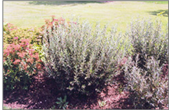
Blue Fox Willow

This shrub does best in full sun to partial shade. It is an amazingly adaptable plant, tolerating both dry conditions and even some standing water. It is considered to be drought-tolerant, and thus makes an ideal choice for a low-water garden or xeriscape application. It is not particular as to soil type or pH. It is highly tolerant of urban pollution and will even thrive in inner city environments. This is a selection of a native North American species.